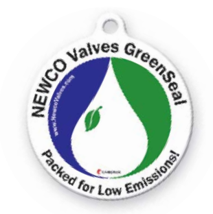
GreenSeal low-emissions packing technology.