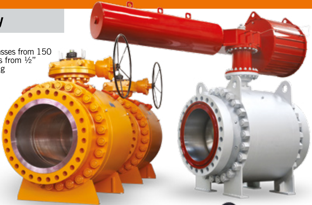
36" 600# RF Gear Operated + Limit Switch.