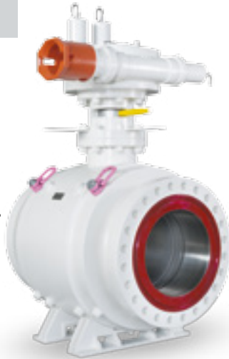
20" 600# RTJ ROV Gear Operated Fully Welded & Fully Cladded.