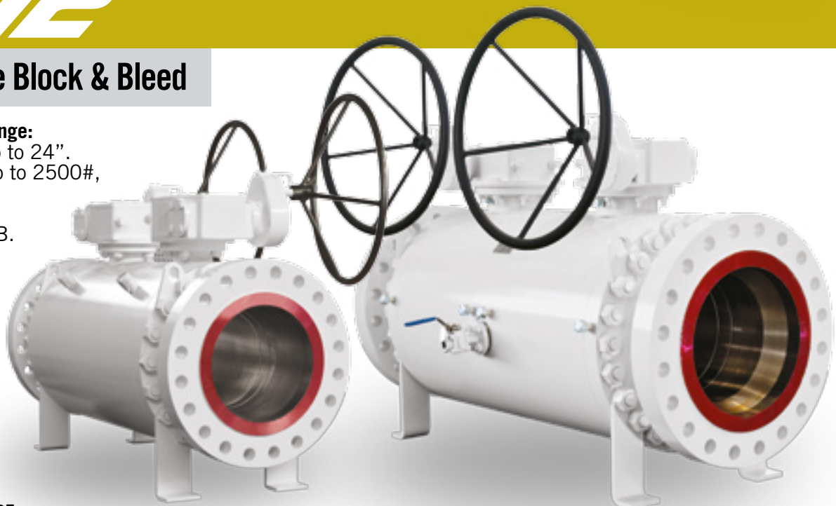
14" 900# RF Fully Cladded - Gear operated.