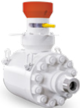
4" 2500# BW F65 + Inconel 625 Fully Clad ROV class IV Direct Drive - 2500 mt. Depth.