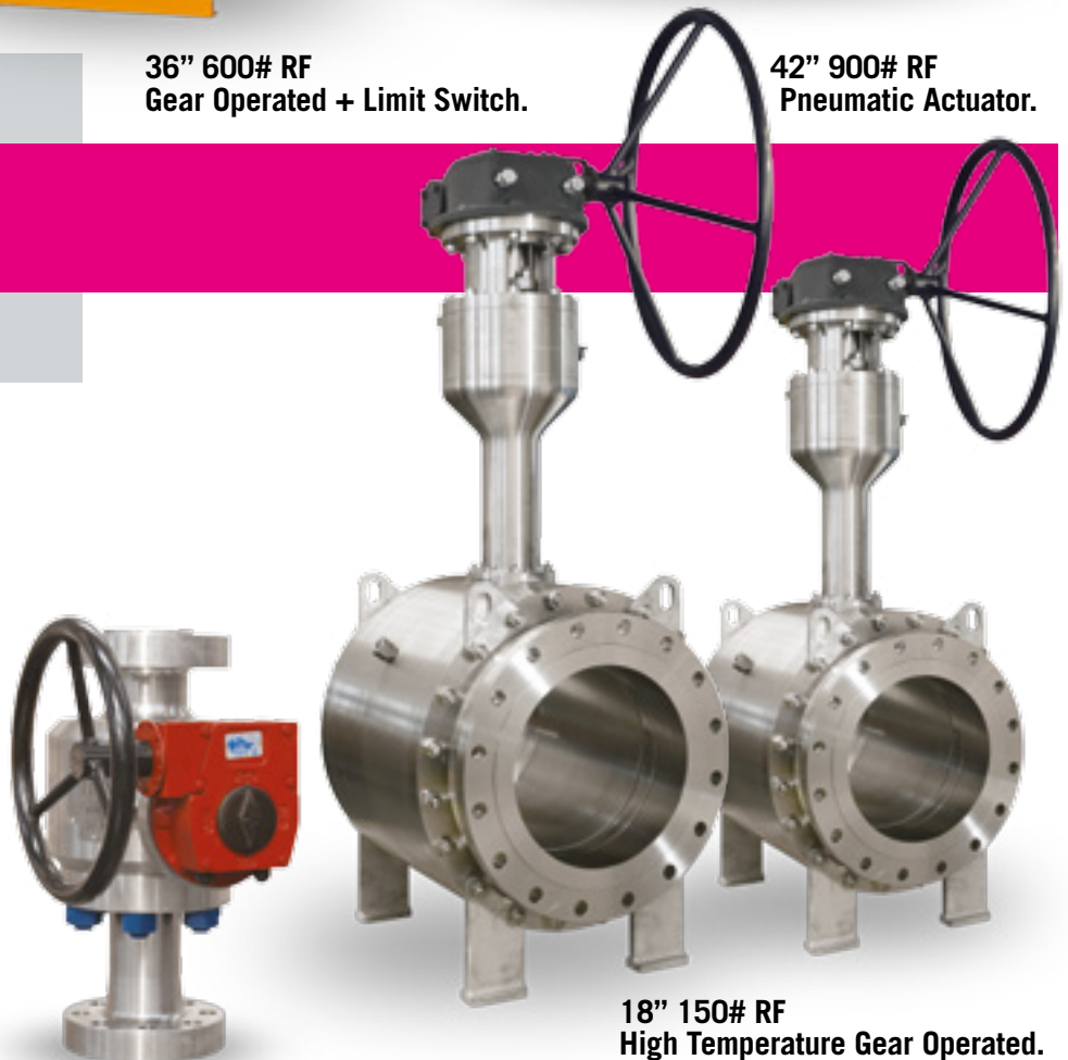
1" 13/16 API 10000 RTJ Gear Operated.