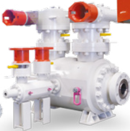
Modular Double Block and Bleed - 5" 1/8 API 5000 RTJ - ROV Gear Operated c/w DBB Bleed Valve 1"13/16 API 10000 BX x 1" MP Autoclave.