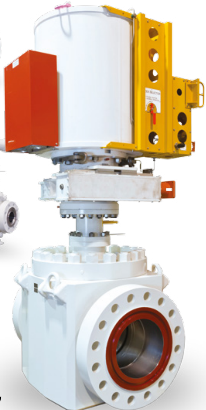
Top Entry - One Piece Forged Body 24" 1500# RTJ with Compact Hydraulic Actuator.