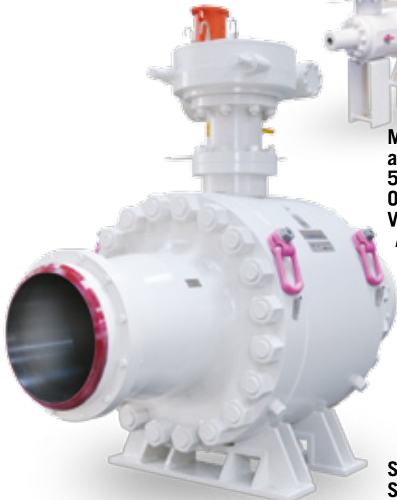
Side Entry 24" 900# BW Subsea Gear Operated.