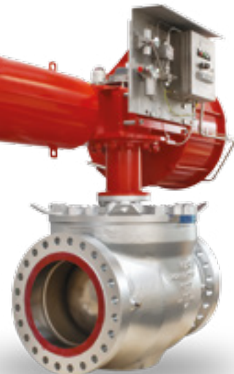
36" 600# BW Electro-Hydraulic Actuator.