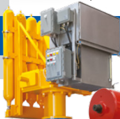
32" 600# BW + Gas Over Oil Actuator for Underground Service.